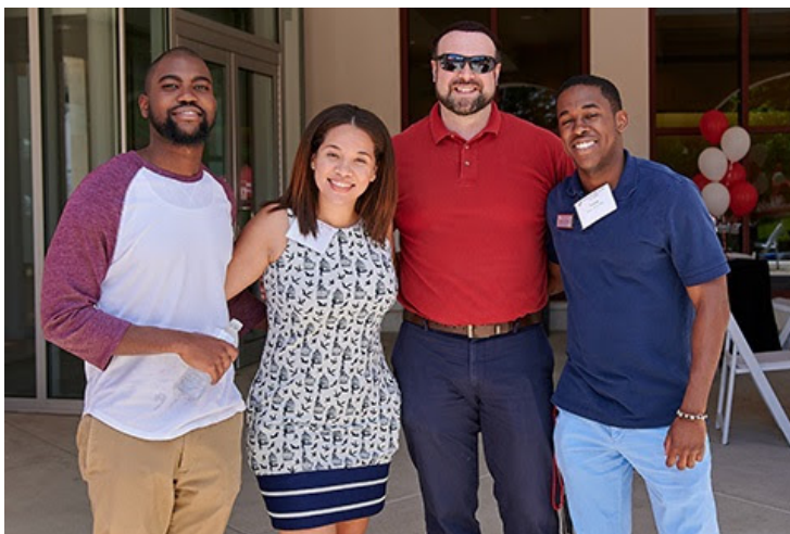
Alumni Campus Employees (ACE) Kick off the Summer with a BBQ

We're announcing a fun and exciting series of events throughout the summer months to bring Montclair State alumni together! From a science filled afternoon to casual networking gatherings, there is something for everyone. Celebrate summer and your alma mater by spending a day with fellow graduates and friends. Our first event of this series was a Red Hawk Happy Hour and networking opportunity at the Red Rock Tap + Grill in Red Bank on July 16. Mark your calendars and join us on Sunday, July 28, for a day at Liberty Science Center! [Learn more]