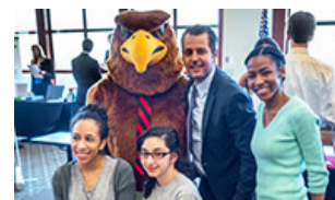
Job Search Bootcamp - July 18