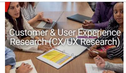
Customer & User Experience Research (CX/UX Research)

In the coming year, Montclair State University will enhance its academic offerings to promote further student success and respond to current and