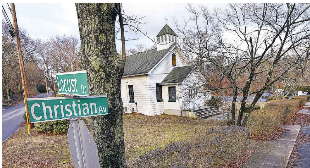
The Setauket community, including Bethel AME Church, formed around Christian Avenue.

events and ideas that have been left out or misrepresented by official maps and related documentations of a place."