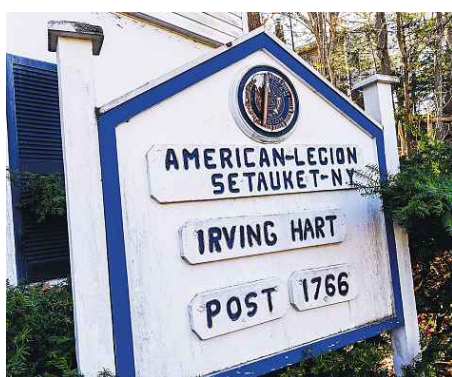
Irving Hart Memorial Legion Hall was founded in 1949 after Black veterans were not welcomed at the existing post.