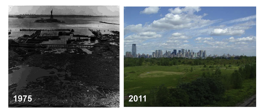
Fig. 2. Images of Liberty State Park, Jersey City, NJ, USA from 1975 recently after rail use abandonment, and from 2011 after 36 years of succession and naturally occurring plant community regeneration.

As with any case of succession, the first pioneers at this site primed the soil and facilitated the success of later arrivals. In the case of un-impacted soils through successional time, theory states that positive feedbacks will eventually give way to negative feedbacks that dominate community dynamics (Fig. 3a, Reynolds et al., 2003). In contrast, in metal-contaminated soil that imposes a stress on the community, he hypothesize that positive feedbacks will play a persistent role, dominating community composition, and becoming increasingly important as the stress or contamination increases (Fig. 3b). In the case of LSP, a naturally-occurring temperate deciduous forest has been developing since abandonment. Early successful colonizers of the park are pioneer tree species: Betula populifolia Marsh. (35% cover), Populus deltoids Marsh. (16% cover) and Populus tremuloides, Michx. (14% cover). Their success may be the result of both soil metal tolerance and metal translocation (Gallagher et al., 2011). Specifically, metal savaging by Fe plaque (Feng et al., 2013) or sequestration within the plant tissue (especially the root) (Gallagher et al., 2008a; Qian et al., 2012) may all be facilitating the long term competitive success of B. populifolia.